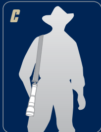
Carry with shoulder strap vertically.