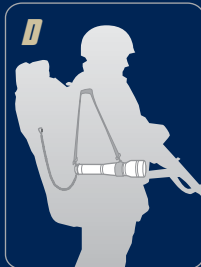
Carrying with shoulder strap, you can add a fall arrest lanyard. (Lanyard is not in the standard kit.)