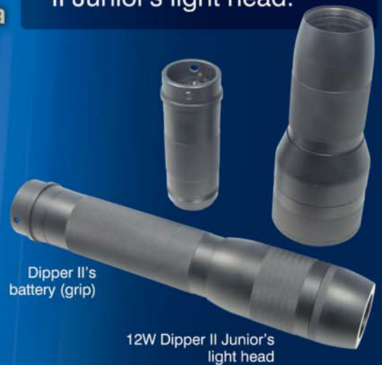
Dipper II's battery (grip)